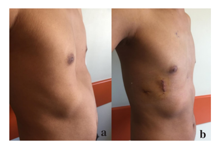
Figure 2. Preoperative view of a pectus excavatum patient (a), postoperative view of a pectus excavatum patient (b).