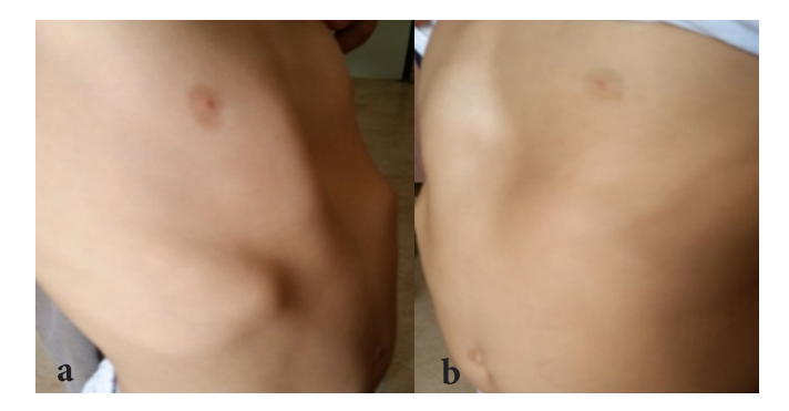
Figure 1. Preoperative view of a pectus excavatum patient (a), postoperative view of a pectus excavatum patient (b).

In all 140 patients, surgery was successful, and morbidity or blood loss was not observed (Figures 1,2). On computed tomography scans, the mean HI was 4.5 \pm 1.4 (range: 2.8-6.2). The mean duration of surgery was 39.5 \pm 21 min (range: 30-120 min). The postoperative mean duration of hospitalization was 4.6 \pm 2.9 days (range: 3-19 days). No pericardial perforation was noted. Three patients underwent Abramson surgery using the sandwich technique, while one underwent thoracoscopic bullectomy and another pulmonary wedge resection. A total of 107(76.4%)patients received one bar, while 31(22.2%) received two bars, and 2(1.4%) received three bars. No patient received more than three bars. Two or three bars were placed for larger affected areas on the 93 chest wall (Figures 3,4).