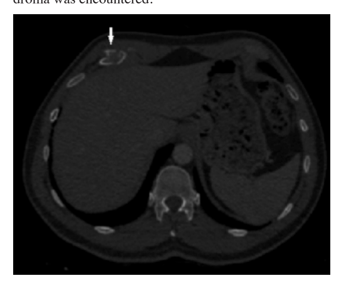
Figure 1. Axial reformation, mediastinal window of CT scan shows a lesion on the surface of rib. This lesion is radiolucent at partial places and in some regions calcification and lobules which have cartilaginous density can be seen. Note the asymmetry of bone and surrounding soft tissue relative to same rib level alignment of opposite sight. Calcification can be seen in the medullary cavities of lesion.

are bone tissue in the size of 3.5x1.5x2 cm and associated tissue in the size of 2.5x1.5x1 cm and tissues in the size of 3x3x0.5 cm, which were sent as a multiple fragment. Histopathological investigation of lesion was compatible with periosteal chondroma (Figure 2). Margins of resected tumor material which was send to the pathology laboratory was reported as tumor free. During his post-operative fallow up no complication was occurred, and the patient was discharged 3 days after his surgery. After partial rib resection surgery, patient's symptoms were regressed, and patient had reduced pain. By the time this article was written, 3 months later of patient's surgery, no recurrence of periosteal chondroma was encountered.