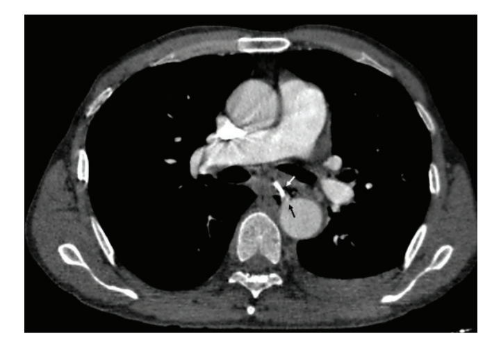
Figure 2. Axial contrast computed tomography shows hyperdense foreign body in the esophageal lumen (white arrow) and small pseudoaneurysm of the descending aorta (black arrow).