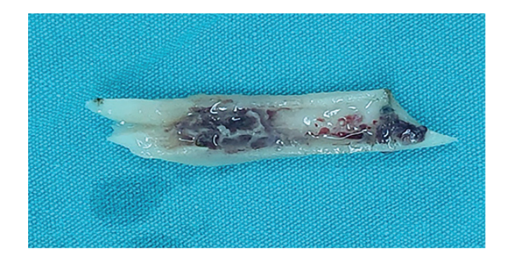
Figure 4. Postinterventional image of the foreign body.