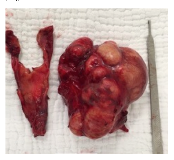
Figure 3. Excised cystic lesion.

On gross examination, the cystic mass was multilocular, thin-walled and filled with red, yellow fluid. On microscopic sections, the cyst had smooth muscle tissue, cartilage and mucus glands on its wall. It was lined with ciliated cylindrical respiratory mucus epithelium, thus established a histopathologic diagnosis of intradiaphragmatic bronchogenic cyst.