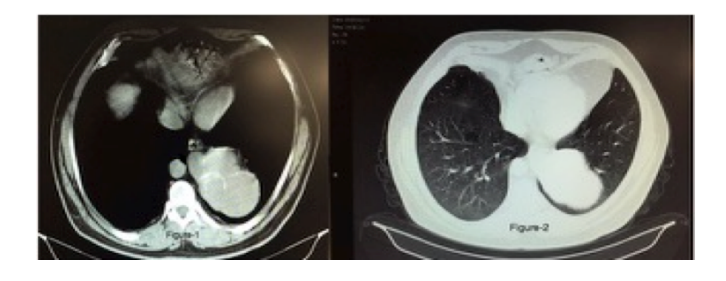
Figure 1. Thorax CT shows a lobulated, calcified, well-defined, homogenous soft-tissue density lesion with calcifications along the wall in the left posterior mediastinal region.

Our patient, a 56-year-old man, was referred to our institution for chest pain of one year duration. General physical examination and routine laboratory tests were unremarkable. The thorax CT revealed a lobulated, calcified, well-defined, and homogeneous mass, of 6x8x6 cm at the lower zone (Figure 1).