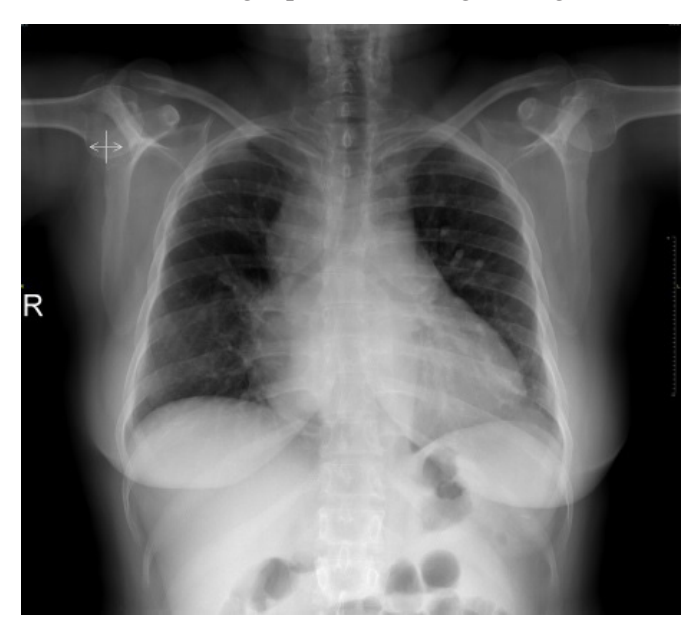
Figure 1. Preoperative chest x-ray of the patient.

A 54-year-old woman referred to our clinic with progressive dyspnea. Her surgical history includes appendectomy, cesarean section and a lumbar hernia operation. Her physical examination was considered normal except a lack of ventilation in the right hemithorax. No goiter, hepatosplenomegaly or significant lymphadenopathy was noticed. Laboratory blood tests revealed haemoglobin level 11.9 gr/dL, leukocyte level 3.2 × 103/\mu L (neutrophils 53%, lymphocytes 35%, eosinophils and basophils both 0%) and thrombocyte level 136 × 103/\mu L. Her renal and liver functions were reported normal. The plain chest X-ray revealed a smooth, masslike lesion in the right paratracheal region (Figure 1).