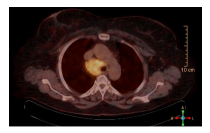
Figure 2. PET-CT demonstrate high FDG uptake in the mass.

There were no invasion of structures such as the phrenic nerve, major vascular structures, lung, or sternum. To differentiate malign and benign conditions, PET-CT reported a high FDG uptake (Figure 2).