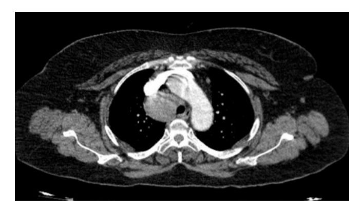
Figure 1. 6x7 cm solid, homogeneous, smoothly limited mass located in right paratracheal region.

A 67-year-old female presented with complaints of breathlessness and chest pain for the last four months was referred to our department. The patient was a non-smoker, and there was not any history of chronic illness, prior hospitalization or surgery. Her family history was also non-significant. The laboratory tests showed only leukocytosis (13.0 \times 109/L) and mild anemia (hemoglobin 11g/dL). Chest radiogram revealed mediastinal enlargement, so thorax computed tomography is taken. Thorax CT is revealed a 6x7 cm solid, homogeneous, smoothly limited mass located in the paratracheal region in the middle mediastinum (Figure 1).