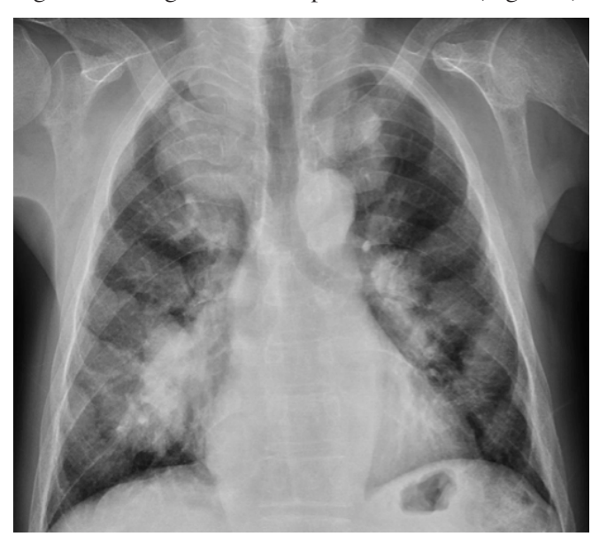
Figure 3. The patient was followed up for 3 years without any active complaints and no significant change was observed during the radiological follow-up examinations as shown on PA chest x-ray.

The mass lesions in the thorax were first interpreted in favor of EMH in consultation with hematology and radiology because of the diagnosis of thalassemia. Complications that may arise during the diagnostic procedure were discussed and the patient was informed and no histopathological confirmation was done. The patient was followed up for 3 years without any active complaints and no significant change was observed during the radiological follow-up examinations (Figure 3).