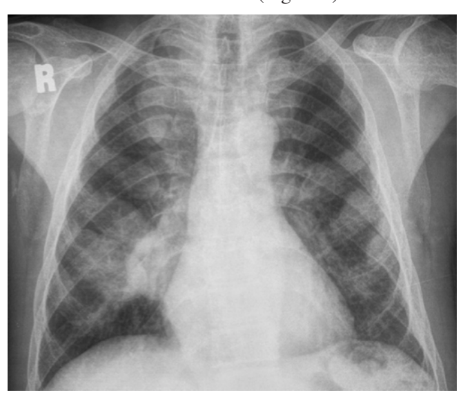
Figure 1. PA chest x-ray showing multiple homogeneous density increments and not obliterating the cardiac contours.

Three years ago, a 42-year old patient with no complaint was referred to Erciyes University, Department of Thoracic Surgery due to multiple homogeneous density increases on posterior-anterior chest x-ray, which had been performed for follow-up. It was learnt from the history that the patient, who was followed up by the Department of Haematology with the diagnosis of thalassemia intermedia and needed erythrocyte suspension once in every 3-4 months, underwent splenectomy in another center 20 years ago. His complete physical examination revealed no additional systemic pathology except for conjunctival pallor and his laboratory test results were as follows; Hgb: 8.7gr/dL, WBC: 10.610/ mm3; Plt: 358.000/mm3. His PA chest x-ray showed multiple homogeneous density increments that did not obliterate the cardiac contours (Figure 1).