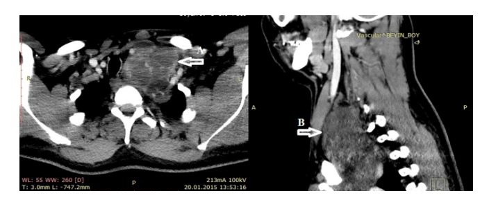
Figure 1. Thorax CT showing a mass lesion of 82x68 mm extending from the supraclavicular region to the upper level of the aortic arch.

A 33-year-old male patient presented to our clinic complaining about shoulder pain and swelling in his neck. The computed tomography (CT) of the thorax revealed a mass lesion of 82x68 mm extending from the supraclavicular region to the upper level of the aortic arch invading left subclavian artery and scalene muscles (Figure 1). Positron emission tomography revealed a SUVmax value as 5.8. As the pathologic examination of the transthoracic tru-cut biopsy demonstrated Ewing sarcoma, he received six cycles of cisplatin and etoposide chemotherapy. Seeing that there was no regression in the mass and the patient's shoulder pain increased after chemotherapy. Since the patient did not accept the additional treatment after the chemotherapy, the decision for surgical treatment was taken by the oncology council.