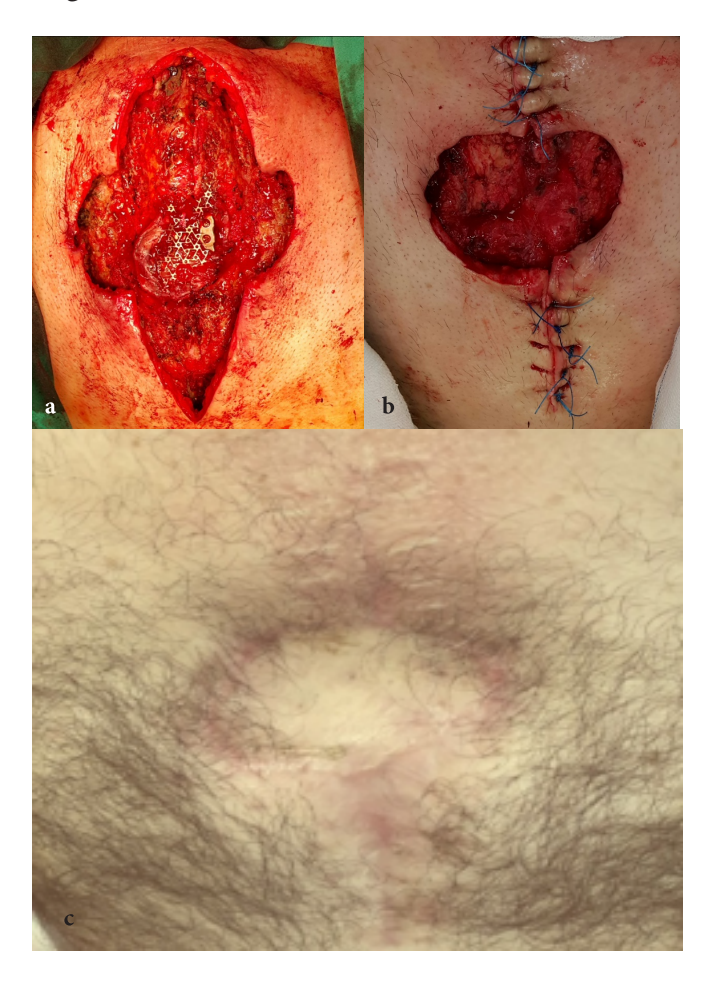
Figure 2. Peroperative image showing surgical debridement (a), primary suturation (b), postoperative view (after NPWT the wound was repaired by split thickness skin graft) (c).

The lower and upper portions of the cruciform incision was sutured primarily, and then NPWT was applied to the central area that lost excess skin and tissue (Figure 2b).