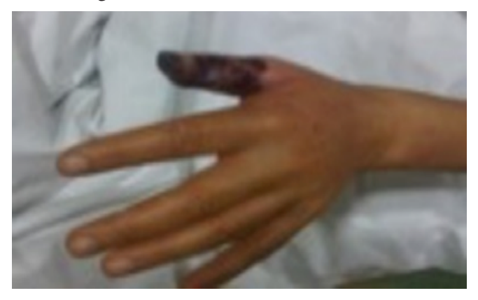
Figure 3. Healing process of a Buerger's patient with ulcer is shown preoperatively.

A whole recovery and progress have been succeeded in the patients of 33% with ulcer and Raynaud's. As for the patients with no ulcer, the perfect success in the form of recovery and improvement of the symptoms has been 70% and whereas the partial success is 30%. In the survey of quality of life, 95.6% of the patients have indicated that they feel better and gave a higher score. The complete success of sympathectomy in the patients with Buerger's has been assessed as 40% for the cases with ulcers (Figures 3-5). The symptom recovery rate could not be determined as there were no cases without ulcer and according to the survey of quality of life, success was again 95.6%.