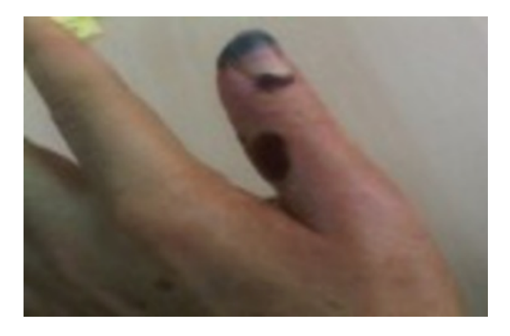
Figure 4. Healing process of a Buerger's patient on day 10 postoperatively.