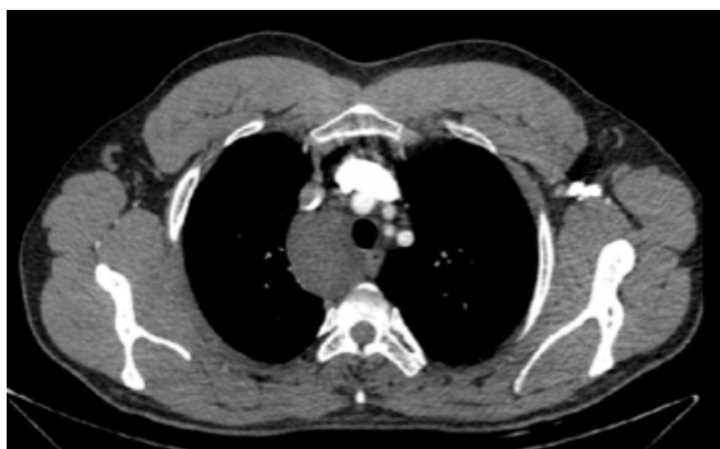
Figure 1. Thorax CT showing a thin layered, fine-lined lesion with cystic at the right paratracheal level.

A 24-year-old non-smoker male patient admitted to our clinic with an incidentally found well-circumscribed radioopacity located in the right upper zone of the mediastinum during a pre-marital routine chest x-ray examination. Computerized thorax tomography (CT) revealed a thin-layered, fine-lined 8x6 cm cystic lesion located at the right paratracheal level (Figure 1).