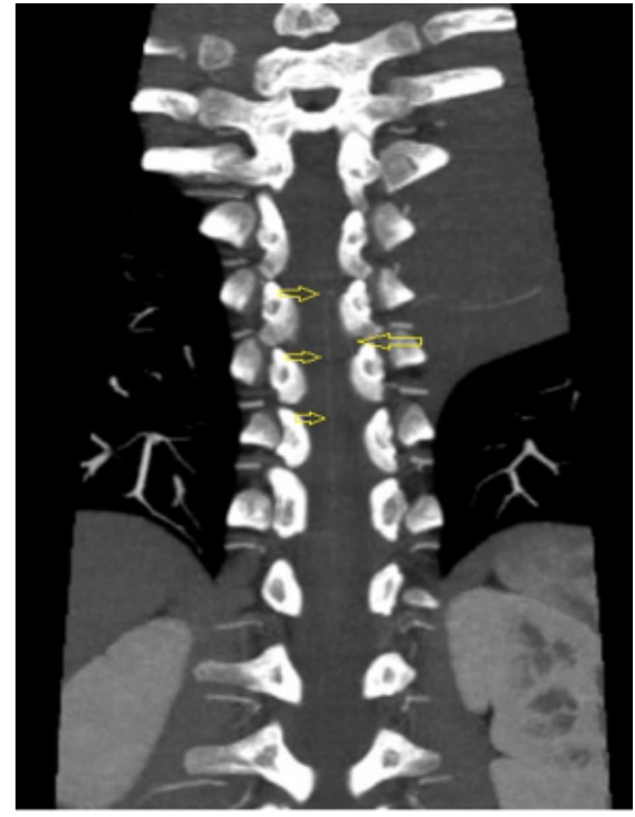
Figure 2. Longitudinal course of the Adamkiewicz artery (arrows) can be seen on maximum intensity projection (MIP) reformatted coronal thorax CT angiography.