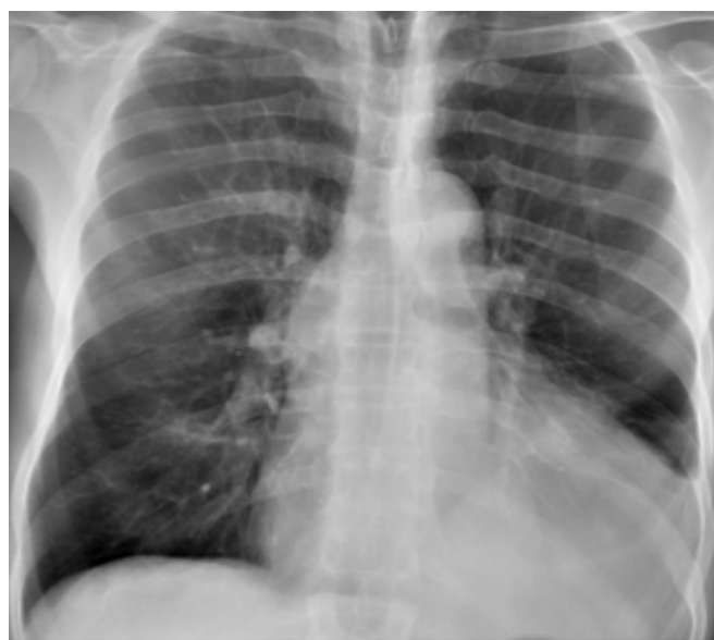
Figure 1. Chest x-ray at the first admission.

A 52-year-old male patient was admitted to our clinic with bloody sputum and dyspnea. The patient was diagnosed with chronic obstructive pulmonary disease (COPD) three years ago and medical treatment was started. At patient's first admission to our hospital, he was first evaluated by chest x-ray and Morgagni hernia was considered as a preliminary diagnosis (Figure 1).