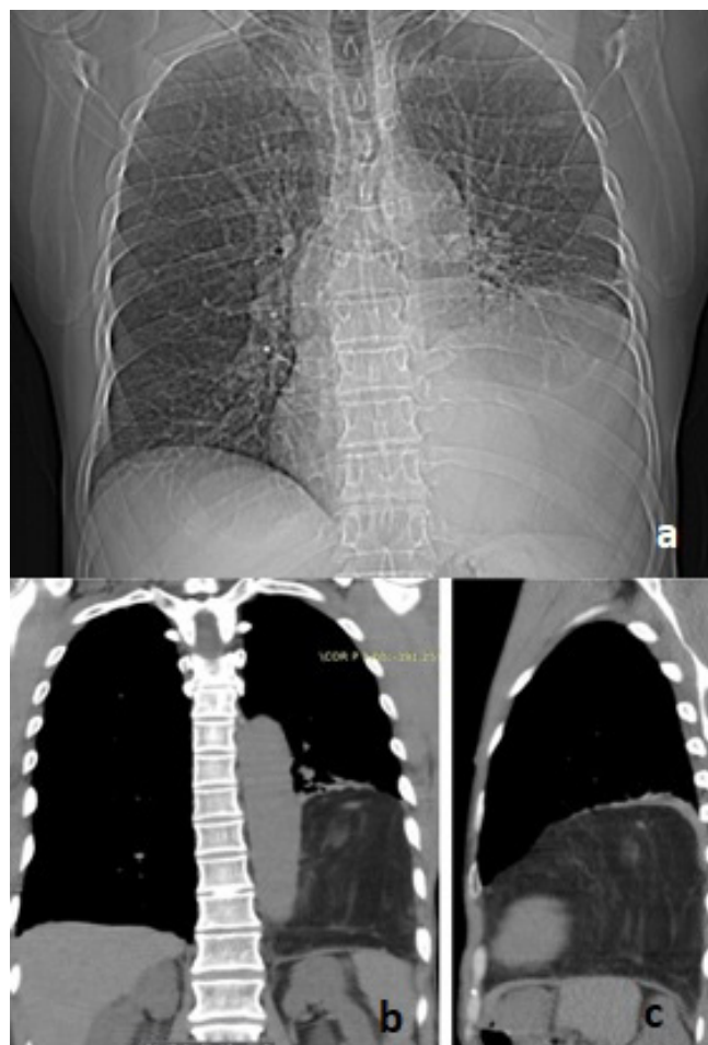
Figure 2. Chest x-ray (a), thorax CT showing the lesion of fat density (b,c).

Unfortunately, the patient refused further examination and treatment. At the second admission nine months later, he had only dyspnea. The patient was reevaluated by chest x-ray and thorax computed tomography (CT) scan. Thorax CT scan revealed a 16x12.5x8.5 cm lesion containing largely fat-density and prominent vascular structures in the middle lower mediastinum (Figure 2).