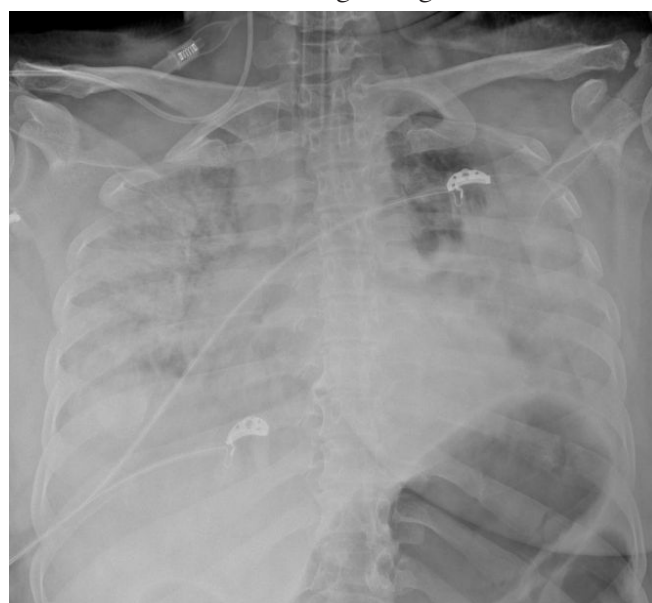
Figure 2. Anteroposterior chest X-ray showing bilateral infiltrations.

During ECMO noradrenaline infusion was started for the normotensive target. After the first 24 hours, enteral nutrition and an empirical antibiotic therapy were started. Due to resistant hypoxemia on the first day of ECMO, PEEP was set to 14, FiO 2 to 100%, pressure support above PEEP to 18 mmHg, and respiratory rate to 16 in P-SIMV mode at MV. The ECMO was set to "full flow" while the heparin infusion was titrated according to the activated clotting time. Upon achieving the target in ABG in the first 24 hours, PEEP remained constant and the FiO 2 ratio was gradually lowered first in MV and then in ECMO. ECMO was terminated on the 5th day, when spontaneous respiration was observed and bilateral resolution of infiltrates were seen in APCR (Figure 3). During ECMO, no additional problem was encountered except for the transfusion requirement. However, fiberoptic bronchoscopy was performed on the 3rd day of ECMO due to increased airway pressure in MV and the absence of right lung ventilation.