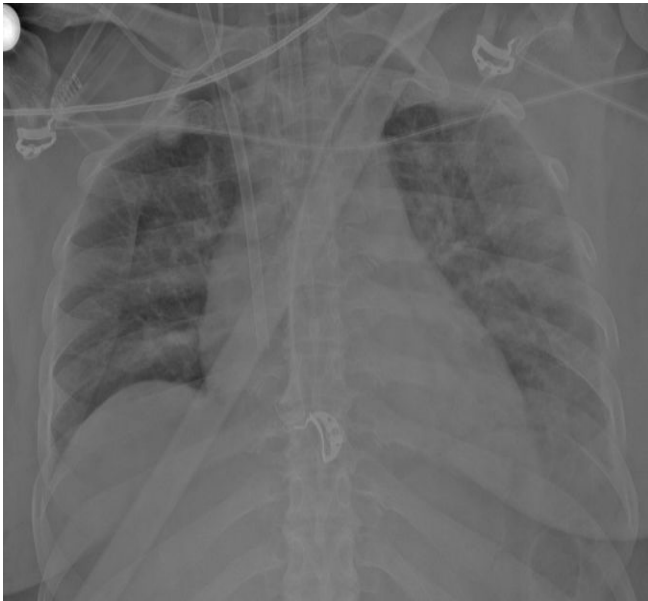
Figure 3. Anteroposterior chest X-ray showing resolution of infiltrates bilaterally.

On the 10th day of intubation, the patient who succeeded the spontaneous breathing in trials was extubated. Nasal high-flow O 2 and NIV support were given. The patient was provided with respiratory physiotherapy. The patient, on the 3rd day of the extubation, was transferred to the orthopedics clinic on the 21st day of hospitalization for the treatment of her existing fractures.