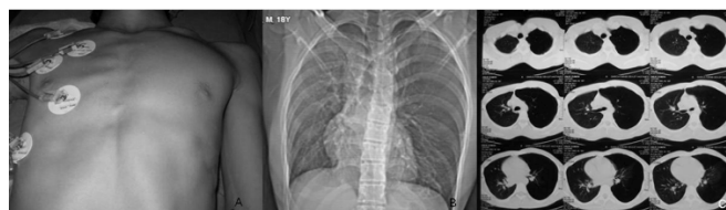
Figure 1. (a) Physical inspection showing enlarged left hemithorax, (b) Preoperative chest x-ray, (c) Computed tomography scan revealing hyper-inflated left upper lobe and mediastinal shift.

An 18-year-old man with gradual onset of mild breathlessness and expansion of left anterior chest wall, for the last 2 years, admitted to our clinic. There was no history of cyanosis, jaundice, convulsion, or heart failure. Physical inspection showed an expanded left hemithorax. On cardiovascular system examination, the heart sounds were shifted to the opposite side. No gross cardiac anomaly was found. Chest radiography and thoracic computed tomography (CT) demonstrated hyperinflation of the left upper lobe and a mediastinal shift to the right side (Figure 1). Pulmonary function tests revealed restriction by forced vital capacity 2.18 L (51%) and forced expiratory volume in first second 1.70 L (50%). Ventilation-perfusion scintigraphy showed reduced perfusion and ventilation in the right lung to 33.4% (upper zone, 1.9%; middle zone, 10%; lower zone, 22.5%). Fiberoptic bronchoscopic examination confirmed the absence of an endobronchial lesion.