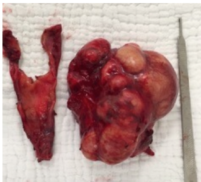
Figure 3. Excised cystic lesion.

On gross examination, the cystic mass was multi-lobular, thin-walled and filled with red, yellow fluid. On microscopic sections, the cyst had smooth muscle tissue, cartilage and mucus glands on its wall. It was lined with ciliated cylindrical respiratory mucus epithelium, thus established a histopathologic diagnosis of intradiaphragmatic bronchogenic cyst.