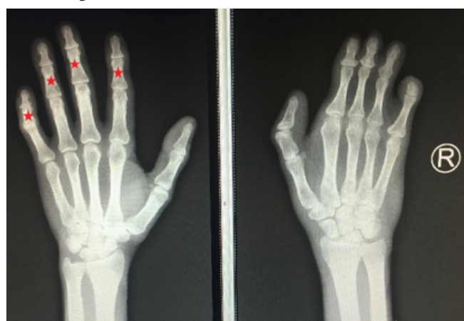
Figure 4. One of the clinical component of Poland's syndrome: hand abnormalities (absence of medial phalanges in right hand) Normal left medial phalanges are seen in this image (asterix).

Tube thoracostomy was performed from the fifth intercostal space on midaxillary line (Figure 5). His symptoms relieved after the intrapleural air was evacuated.