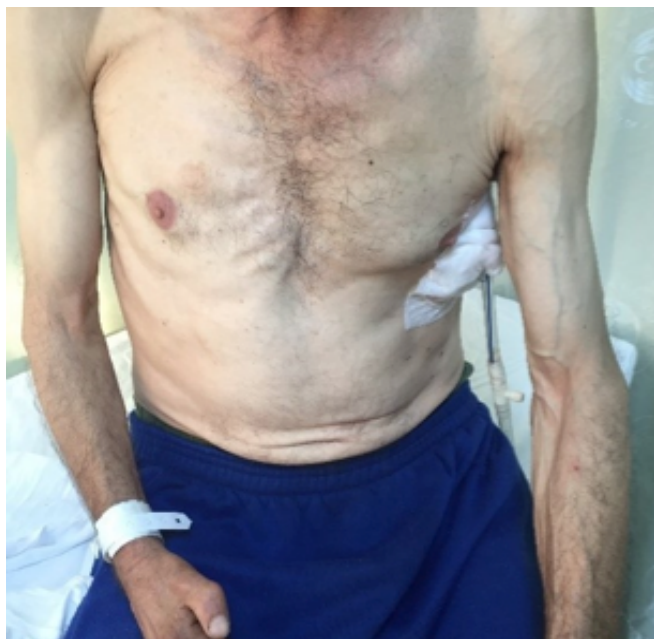
Figure 5. Unilateral chest wall hypoplasia and ipsilateral hand abnormalities.

Lung expansion was obtained on 4th day of drainage. Chest tube was removed and patient was discharged at 5th day of hospitalization.