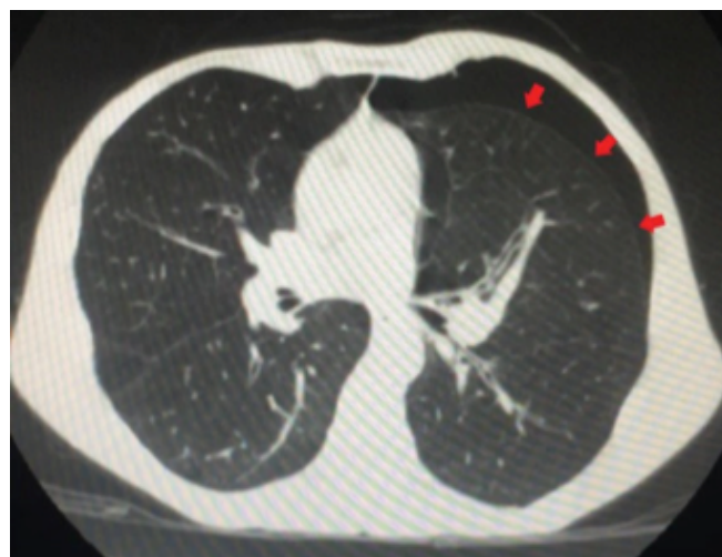
Figure 2. Left pneumothorax and parenchyma line clearly seen in thorax CT image in the axial plane.