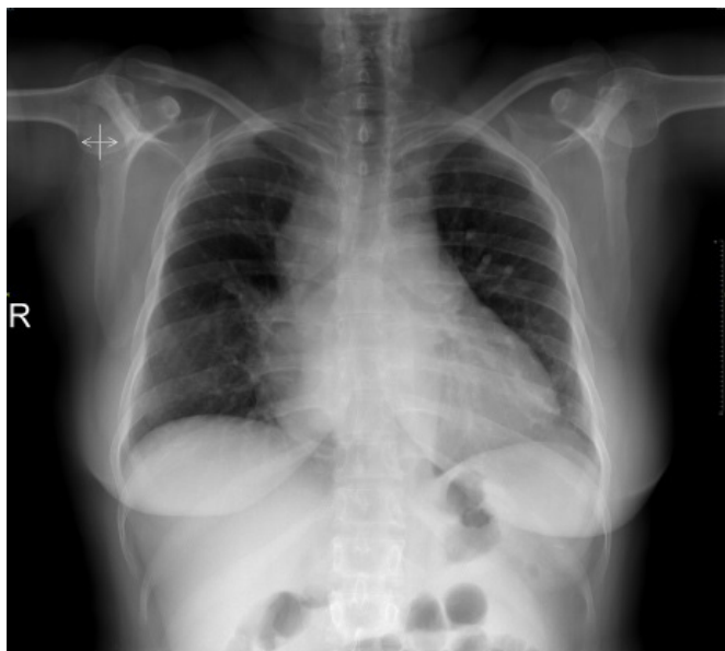
Figure 1. Preoperative chest x-ray of the patient.

A 54-year-old woman referred to our clinic with progressive dyspnea. Her surgical history includes appendectomy, cesarean section and a lumbar hernia operation. Her physical examination was considered normal except a lack of ventilation in the right hemithorax. No goiter, hepatosplenomegaly or significant lymphadenopathy was noticed. Laboratory blood tests revealed haemoglobin level 11.9 gr/dL, leukocyte level 3.2 \times 10^3/\mu\text{L} (neutrophils 53%, lymphocytes 35%, eosinophils and basophils both 0%) and thrombocyte level 136 \times 10^3/\mu\text{L} . Her renal and liver functions were reported normal. The plain chest X-ray revealed a smooth, mass-like lesion in the right paratracheal region (Figure 1).