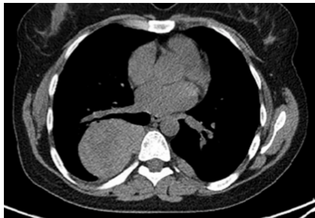
Figure 1. Computed tomography of the thorax demonstrating sharply demarcated bilateral prevertebral-paraspinal masses of soft tissue density. Pulmonary parenchyma and bone structures were normal.

mass lesion lying posteriorly between 6 to 10th thoracic vertebrae at the right side. A second paravertebrally localized lesion was on the left side, sized as 61x47x29 mm, at the level of thoracic 8-10th vertebrae, and a third 24x13x9 mm sized mass lesion at the level of the left costovertebral junction, close to the thoracic 7-8th vertebrae, adjacent to pleura. Mediastinal lymphadenopathies were detected at right paratracheal and left prevascular regions with 11 mm of the largest (Figure 1).