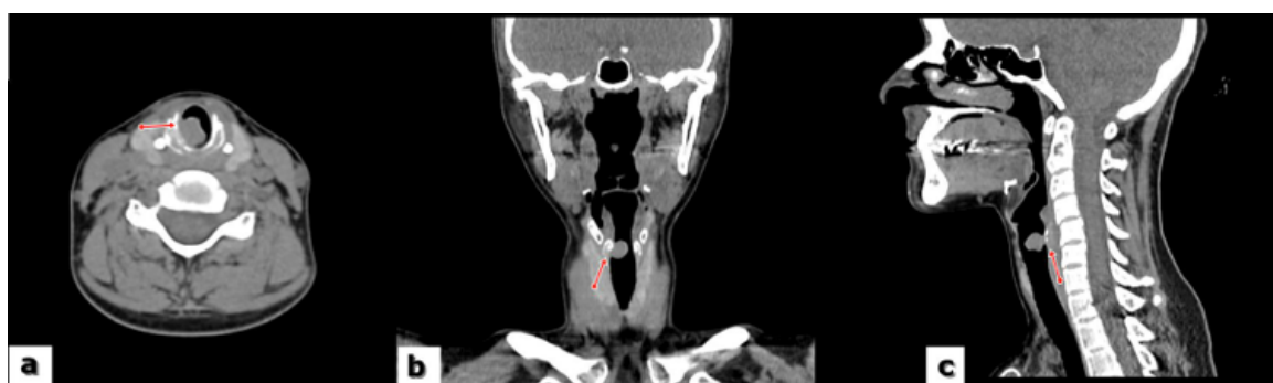
Figure 1. Neck CT scan showing polypoid, soft tissue mass distal to the vocal cords.